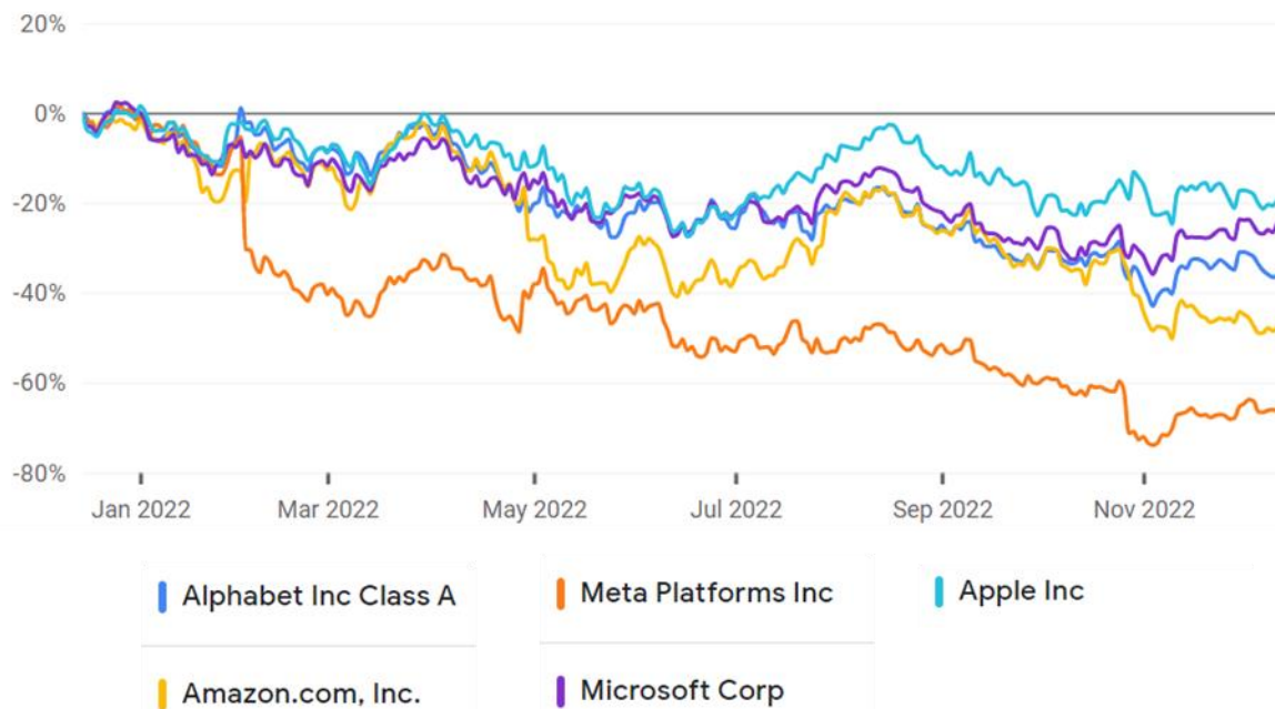
Figure 3 – evolution of share prices of selected tech firms, 2022

2022 proved to be a challenging year for the tech sector, with a number of leading firms registering sizeable falls in their market capitalisation. This was partly a result of macroeconomic headwinds that buffeted the whole sector, with severe inflation, tightening monetary policy and a global economic slowdown. However, as the chart below illustrates, there was a wide divergence in the performance of different companies: while shares in Apple fell by roughly 20% in 2022, Amazon and Meta slumped by more than 40% and 60% respectively.